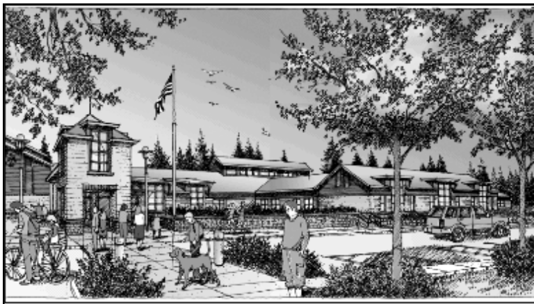
Perspective Drawing of Elementary School #5

Fall City Elementary Gymnasium Floor Replacement project has received new ceiling paint and a successful lowest responsible bid for the gym floor hardwood is pending Board approval. This project remains the first to