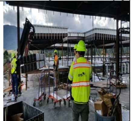
Area A - Stocking Steel Studs 3rd Floor