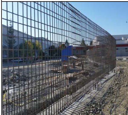
Area D - Retaining Wall Pending Concrete