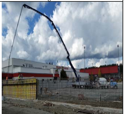
Last Retaining Wall Nearing Completion