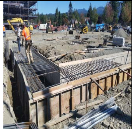
Area D - Last Of The Large Footings