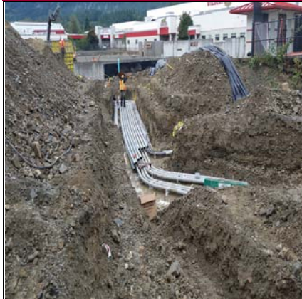
Main Conduit Runs To New Transformer