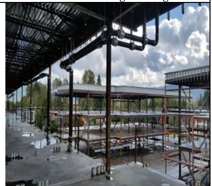
Area A - Installing Internal Roof Drain Piping