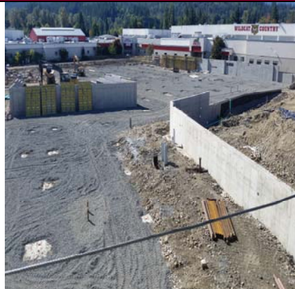
Areas C-E-F - Footings / Ready For Steel...