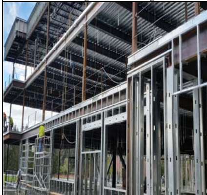
Area A - Steel Stud South Wall Framing