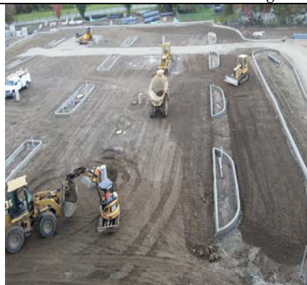
North Parking Lot - Curbing Installation