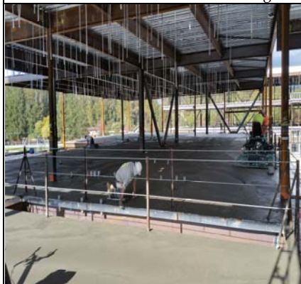
Area B - Concrete Pour West Building