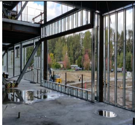
Area A - Steel Stud North Wall Framing