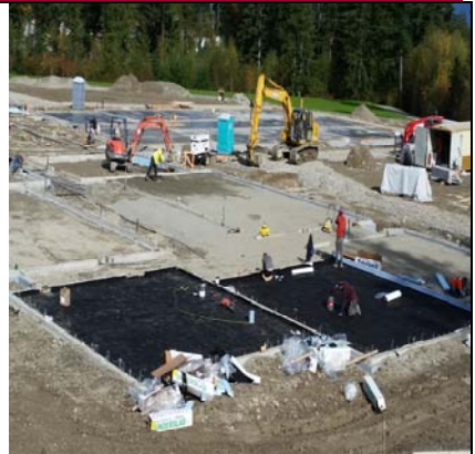
More Waterproof Membrane Installing