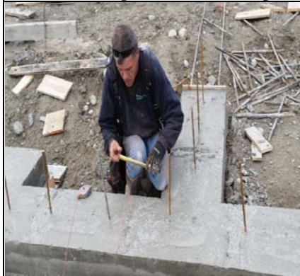
Measure Twice Cut Once - More Layout