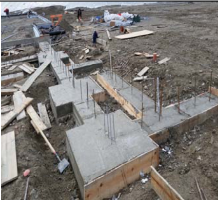
More Footings - Forms And Rebar