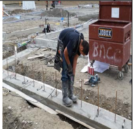
More Form Base Cleats - One At A Time