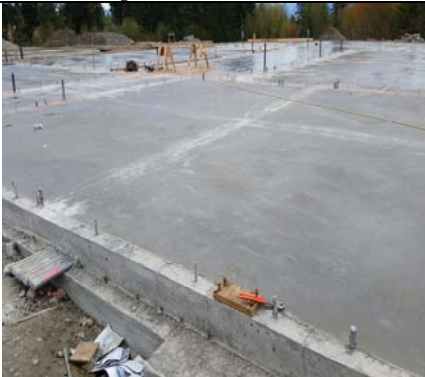
Concrete Slab Ready For Exterior Walls