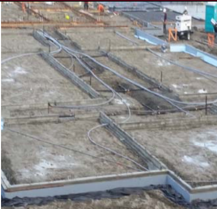
More Under-Slab Ready For Crushed Rock