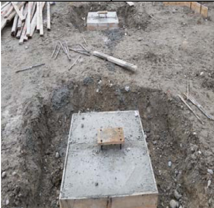
Steel Column Footings For HVAC Mezzanine