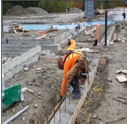
More Forms Being Pulled From Footings