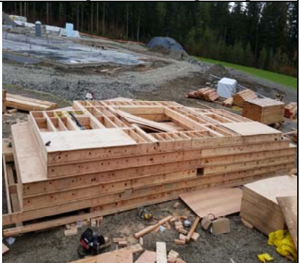
Exterior Walls Ready For A Concrete Slab