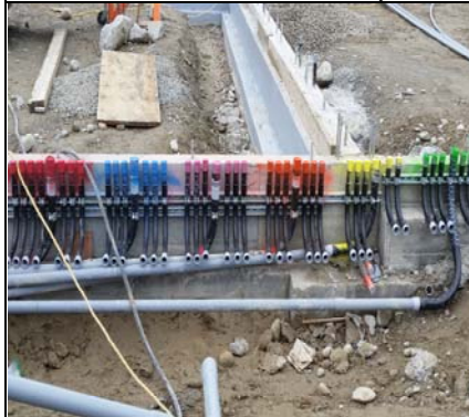
Color Coded Conduit - Room By Room