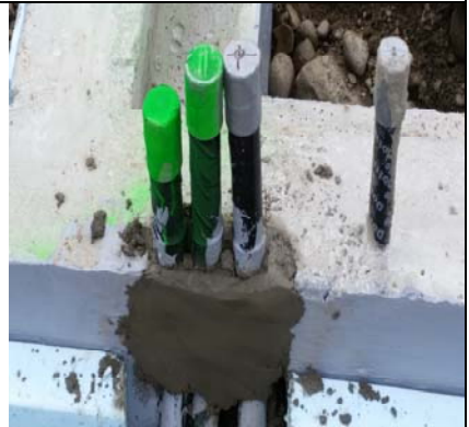
Conduit Prepared For Waterproofing