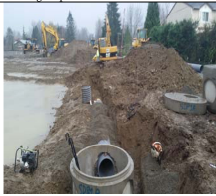
Pipe To Vault Structure Connections 2