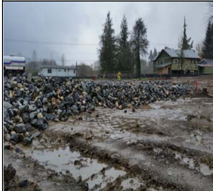
Base Rock Installation Continues