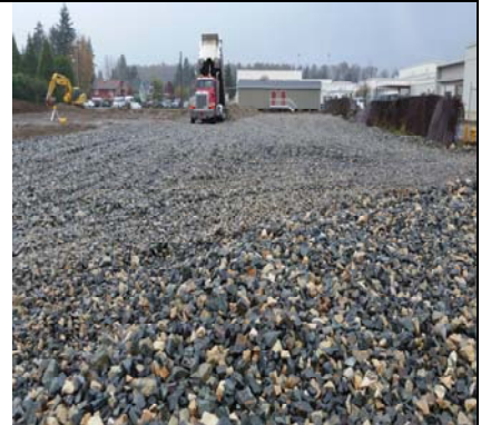
Temporary Parking Lot Base Rock Start