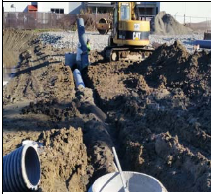
Pipe To Vault Structure Connections 1