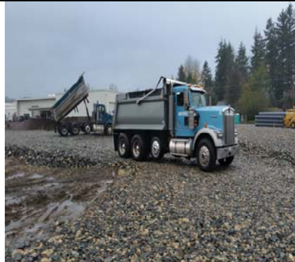
Trucks Importing Large Base Rock