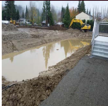
1 of 2 Temporary Storage Ponds Installed