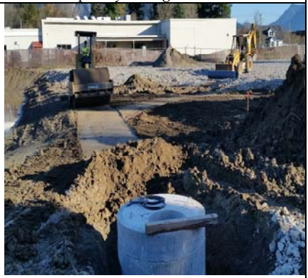
Backfilling And Sealing For Coming Rock