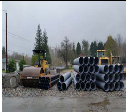
Drainage Pipe & Catch Basins Delivered