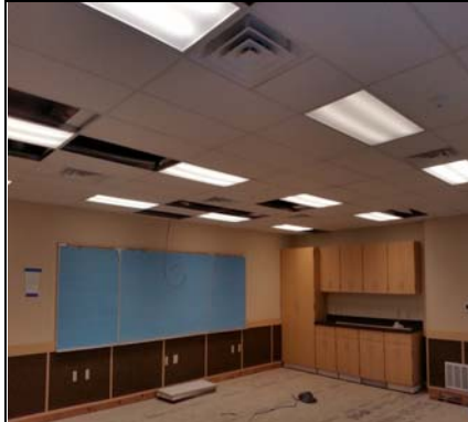
Portable Interior Finishes In Process