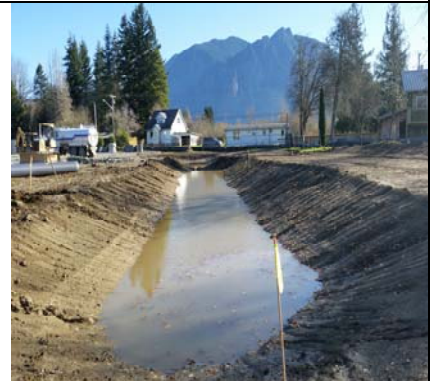
2 of 2 Temporary Storage Ponds Installed