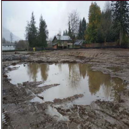
Back Lot - "Wettest October On Record"...