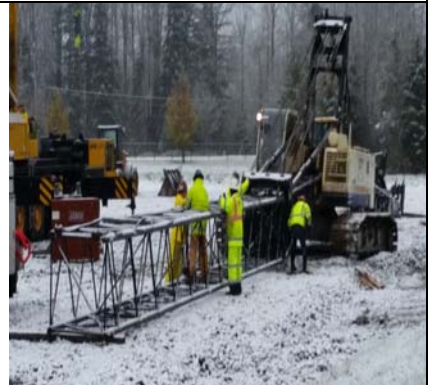
Some Assembly Required