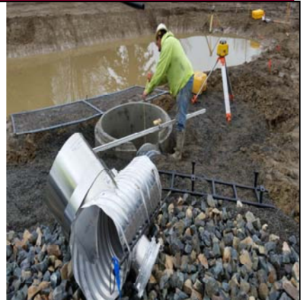
Measuring Up For The Flow Control