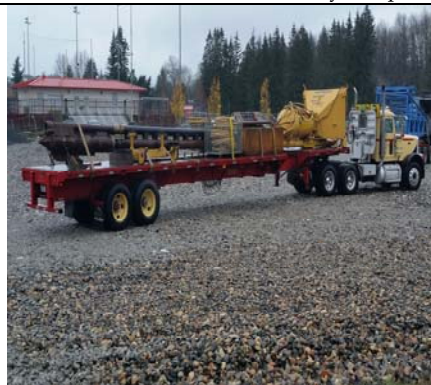
Small Stone Column Probe Arrives