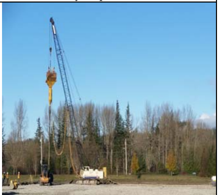
Sunny Day For First Stone Column Install