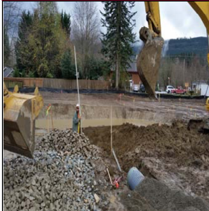
End Of Drain Pipe Run For Control Vault