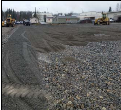
Parking Lot Final Rock Over Spall Base