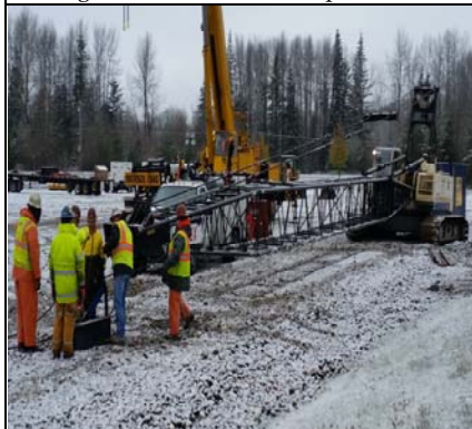
Small Crane Ready For Lifting