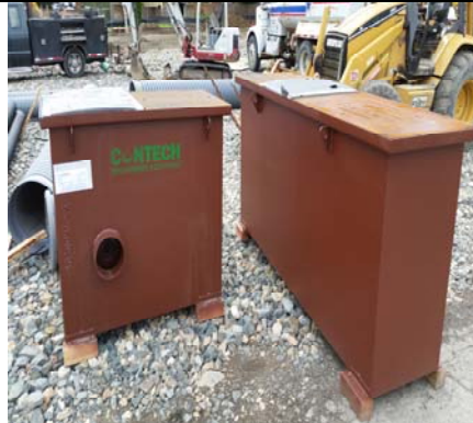
Surface Water Filtration Drainage Vaults