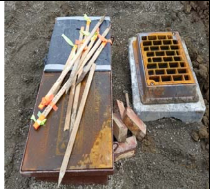
Filtration Drainage Vaults Installed