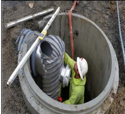
Installation Of Surface Water Flow Control