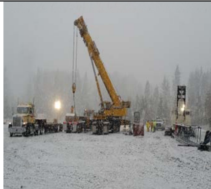
Front Lot Cranes Arrive For Snowy Setup