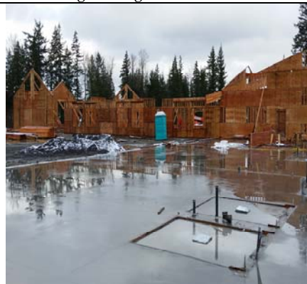
Administration Area Ready For Walls