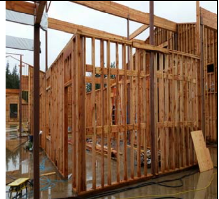
Small Flexible Space Area-Library Support