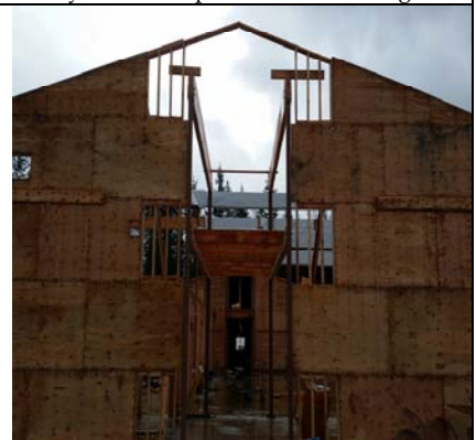
Beams & Columns Ready For Trusses