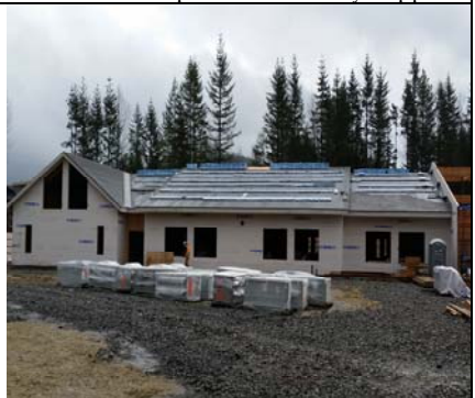
East Wing Close To "Dry-In"