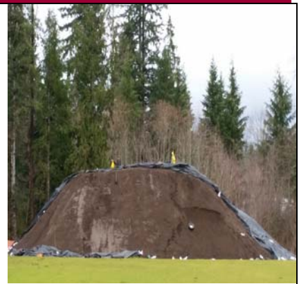
Heavy Winds Require Soil Recovering...