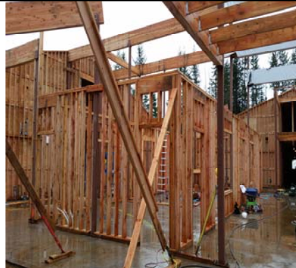
Library Area Support Room Walls