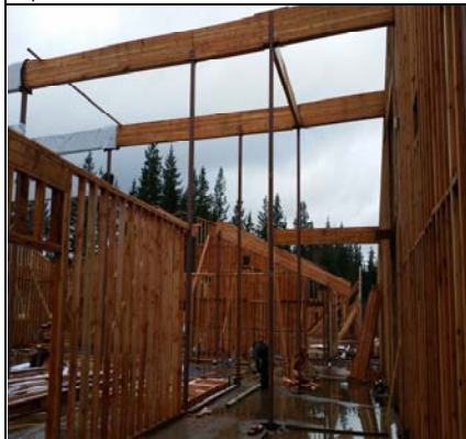
Beams In Core Library Area