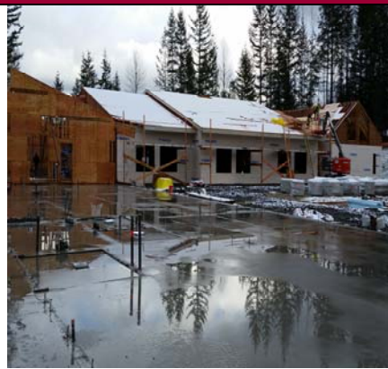
South Wing Roofing Halted...