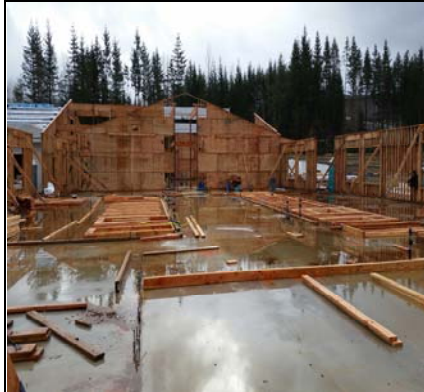
North Wing Walls Being Laid Out