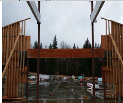
Library Connection To Hallway Pending