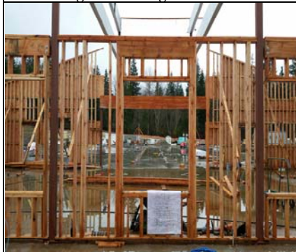
Looking Thru Library Area To Hallway