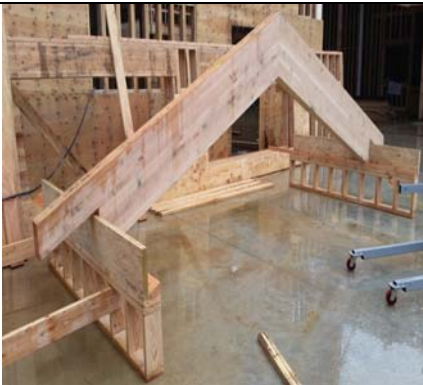
Library Roof Beam "Pop Up" Mock Up