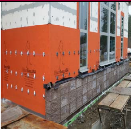
East Wing Water/Air Wrap - Ties - Block