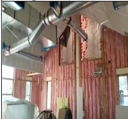
South Wing - Insulation - HVAC Duct