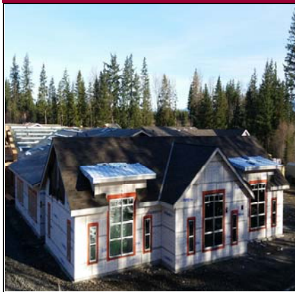
South Wing - Windows/Roof - Dried In