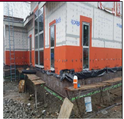
East Wing - Same Scenario - North Side