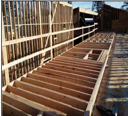
Administration - HVAC Mezzanine Walls