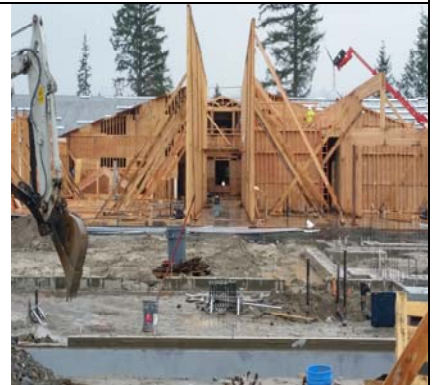
From Kitchen Thru Multi-Purpose To Hall