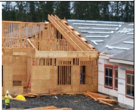
The Administration Roof Trusses Fit