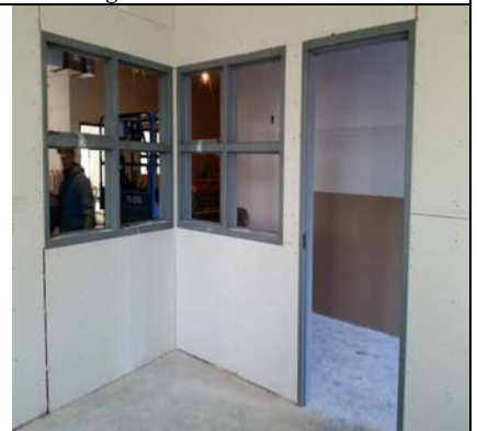
Hollow Metal Window & Door Frames