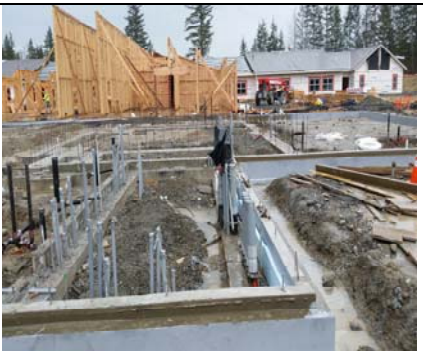
Electrical Room Thru Entry To South Wing