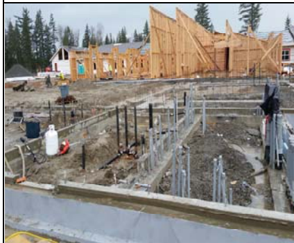
Electrical Room Thru Gym To North Wing