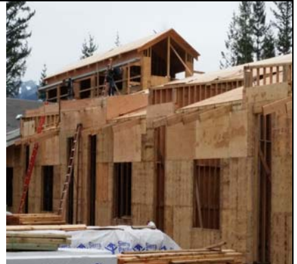
Library Clearstory - Sheathing In Process