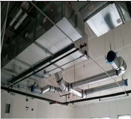
South Wing Classroom Ductwork