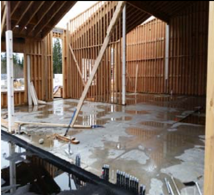
Kindergarten Wing North Side