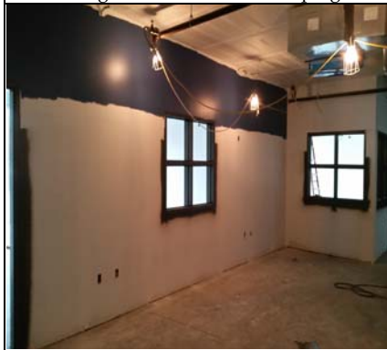
East Wing Accent Painting Has Begun