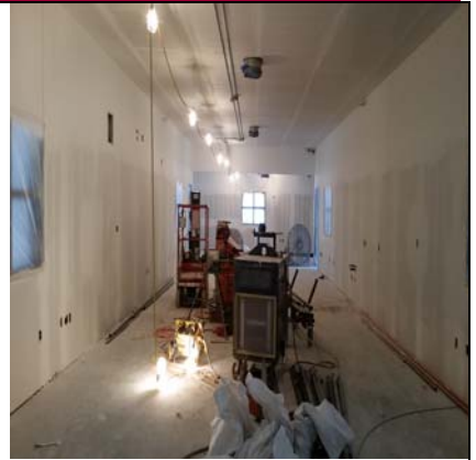
South Wing Wallboard Taping