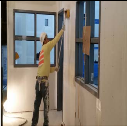
South Wing Wallboard Taping