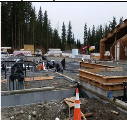
Northwest Wing - Slab Water Barrier Install