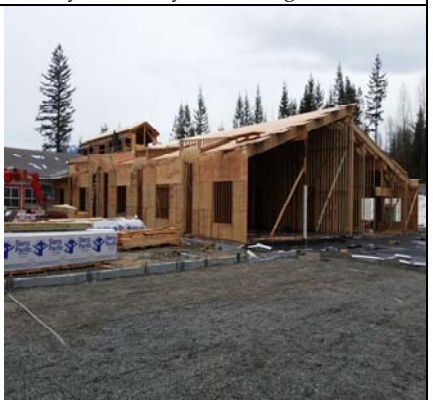
Gym - Pending Waterproof Membrane