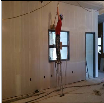
South Wing Interior Wallboard Taping

Pictures Taken: 3/9/2016 - 9:00 a.m. Progress Photographs