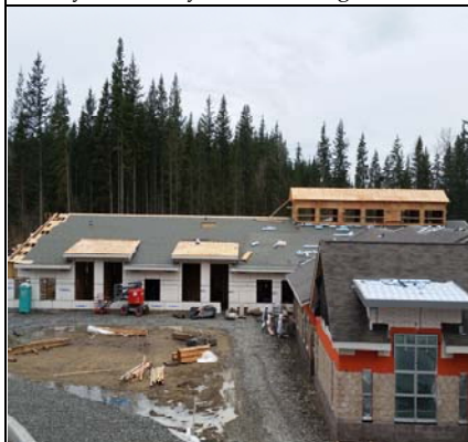
Administration South Side - Block Coming