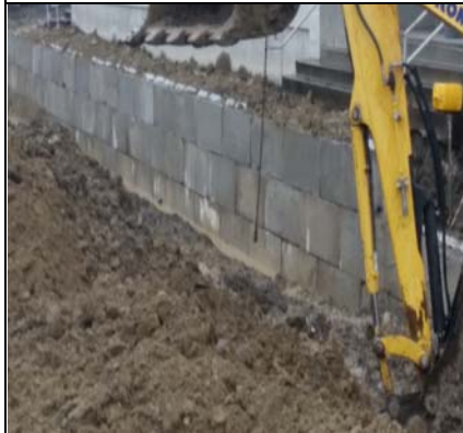
Another Retaining Wall Layer Of Block