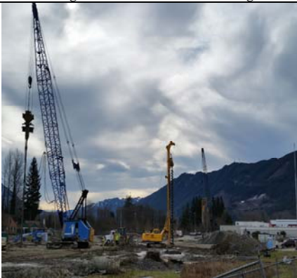
All Stone Column Rigs Running