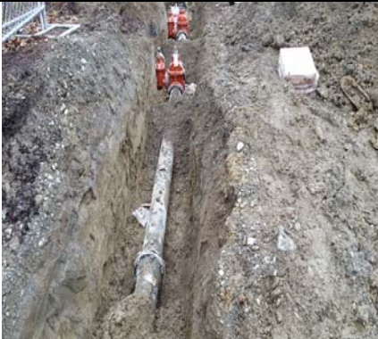
New Water Main Valves For Phase 1