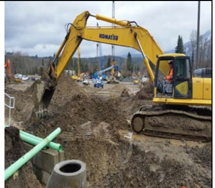
Backfilling Temporary Retaining Wall