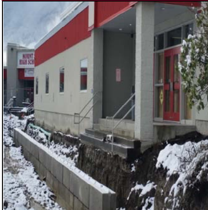
Temporary Retaining Wall & Drainage