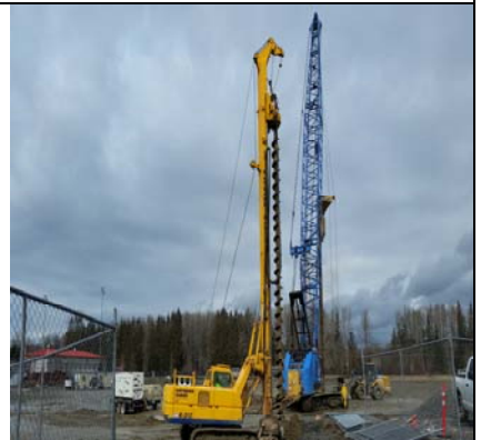
Drilling & Probing Structural Columns