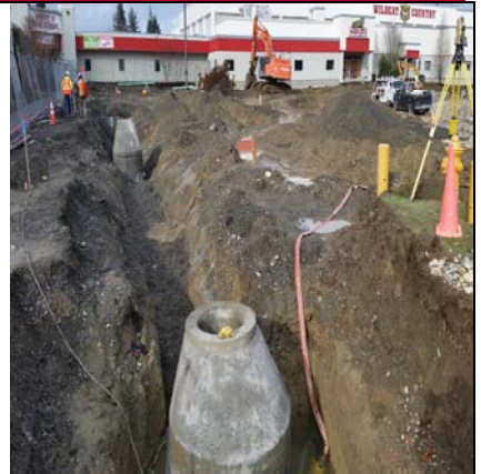
Temporary Sewer Manholes For Phase 1