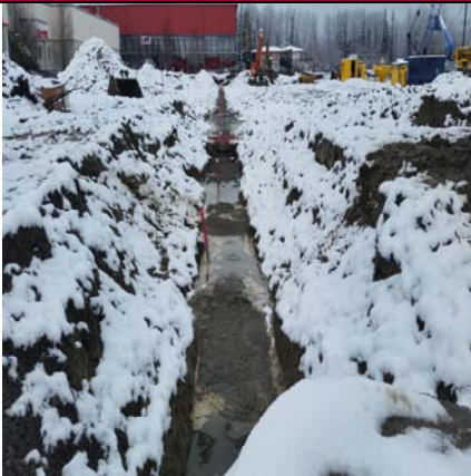
Temporary Sewer Line Encased In Concrete