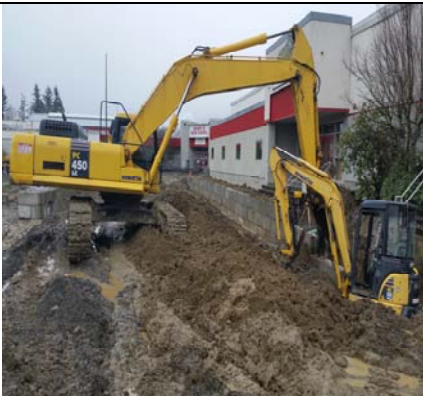
Continuing North With The Retaining Wall