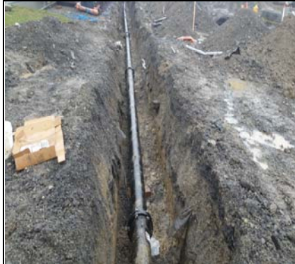
Permanent Water Line For Phase 1