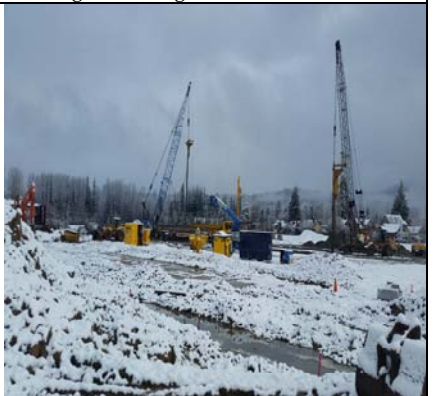
...If It's Not Rain It's More Snow...