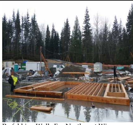
Prefabbing Walls For Northwest Wing