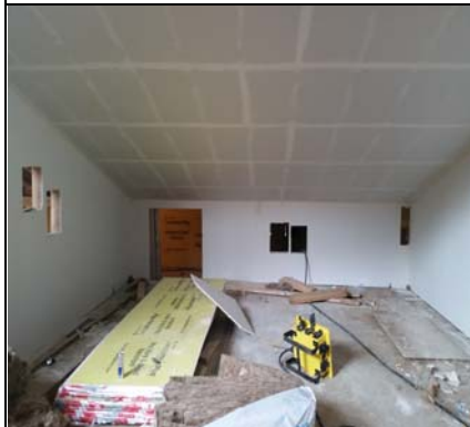
Library Mezzanine Ready For HVAC