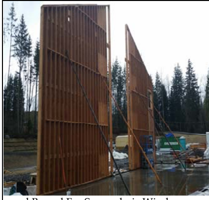
...and Braced For Snoqualmie Winds