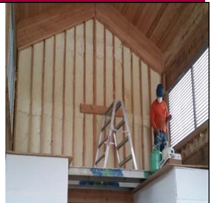
Spray Foam Insulation In Clearstory Walls