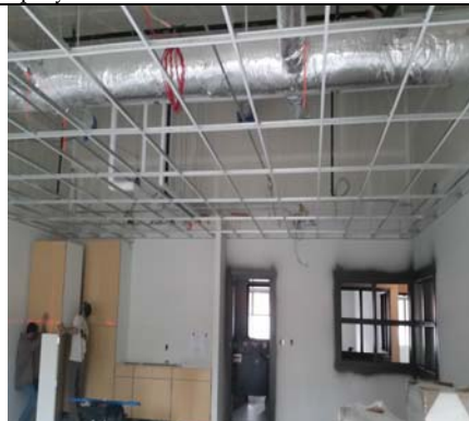
Another Room Of Casework Installation