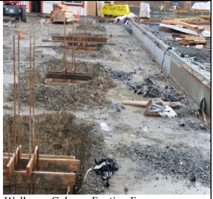
Walkway Column Footing Forms