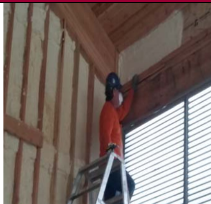
Spray Foam Insulation In HVAC Vent Wall