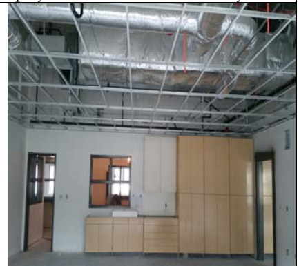
Classroom Ready For Ceiling Lights