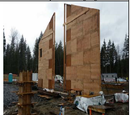
Large Gabled Music Room Wall