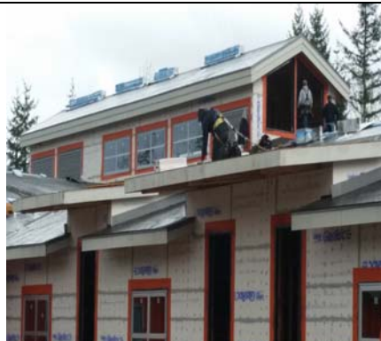
Clearstory In The Dry - Siding Pending