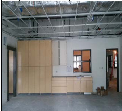
Adjoining Classroom Ready For Lights