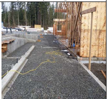
Entry Pending Waterproof Membrane