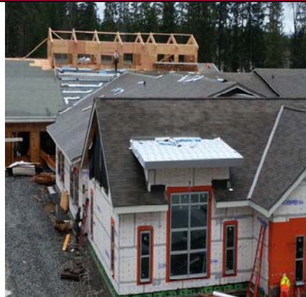
Library Clearstory From South Wing