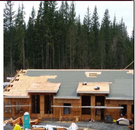
Administration Wing - South Side