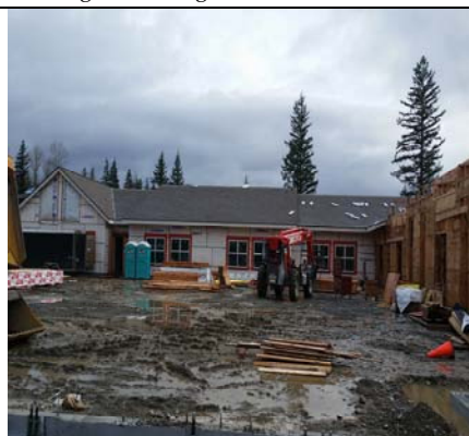
North Wing - West Side Across Playground