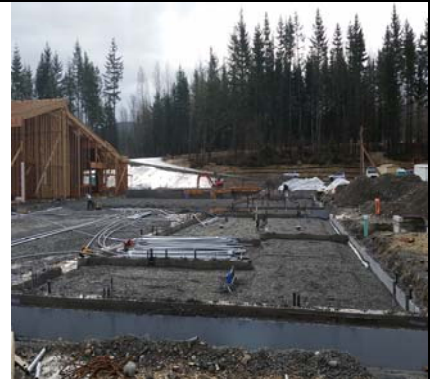
Kitchen Pending Waterproof Membrane