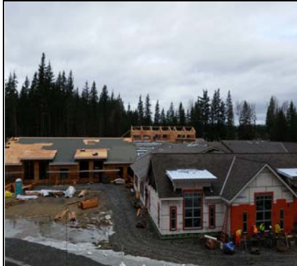
Administration Connection To Library