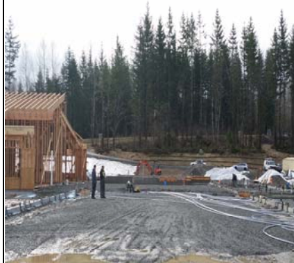
Gymnasium Data/Electrical Conduit