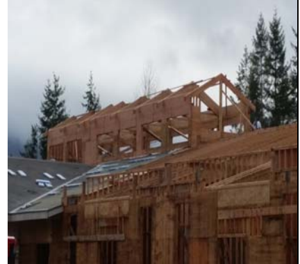
Library Clearstory Framing In Process