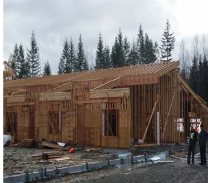
Kindergarten Wing North Side