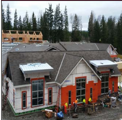
South Wing Exterior Masonry - South Side