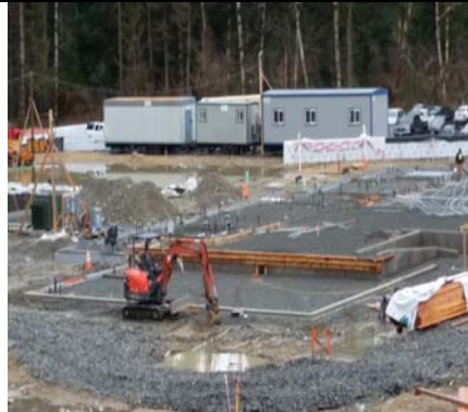
Music/Stage - Pending Waterproof Membrane