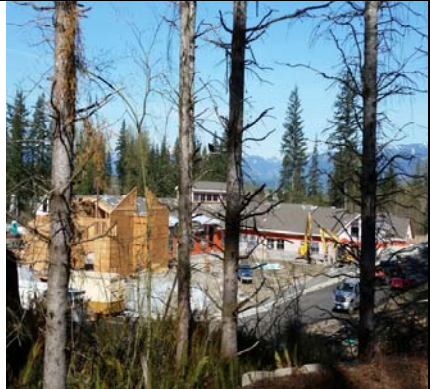
TRES - Southwest Looking Northeast