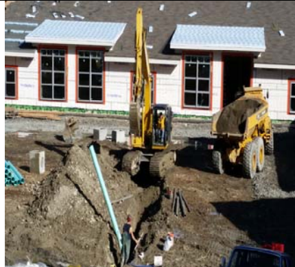
Roof Drainage System Being Installed