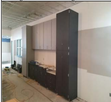
East Wing Breakout Area Casework