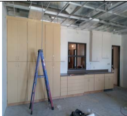
Complete Classroom Casework Setup