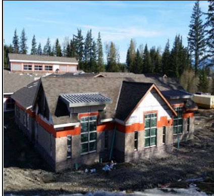
Metal Roofing Installed On Shed Roofs