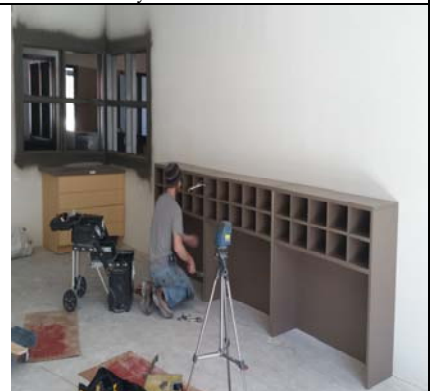
Student Paper Tray/Containers Casework