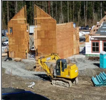
Northwest Wing Walls Going Up