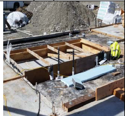
Recessed Slab For Cooler Floor Insulation