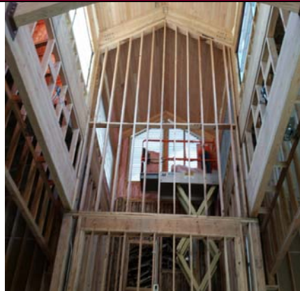
Insulating The Last Of The Clearstory Walls