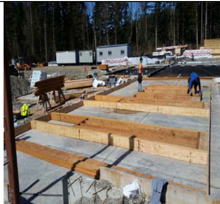
Long Northwest Wing Wall Being Framed