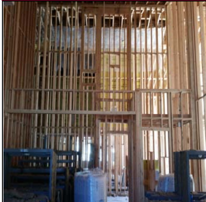
Framing The Last Of Kindergarten Walls

Pictures Taken: 3/30/2016 - 12:00 p.m. Progress Photographs