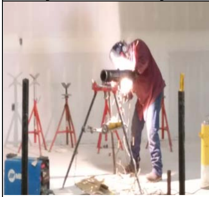
...Connected One Weld At A Time