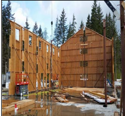
NW Wing - Inside From Entry Area