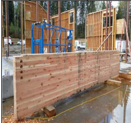
NW Wing - Small Glulam Pending Install