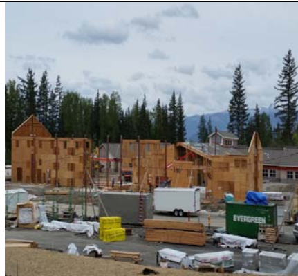
NW Wing - Southwest Looking Northeast