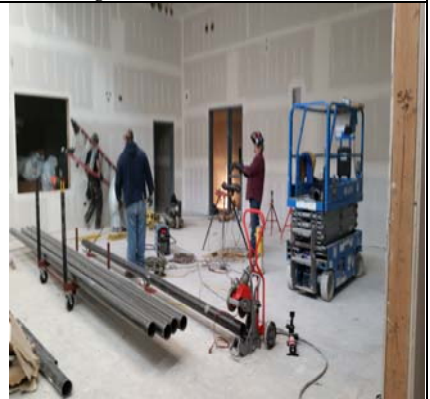
HVAC Hydronic Pipe Installation