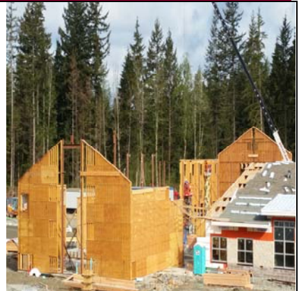
NW Wing - South/Southeast Side