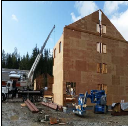
Crane Setting Prefabricated Gym Walls

Pictures Taken: 4/13/2016 - 12:00 p.m. Progress Photographs