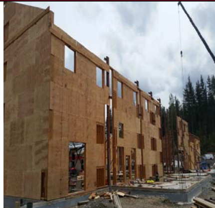
NW Wing - Walls West Side