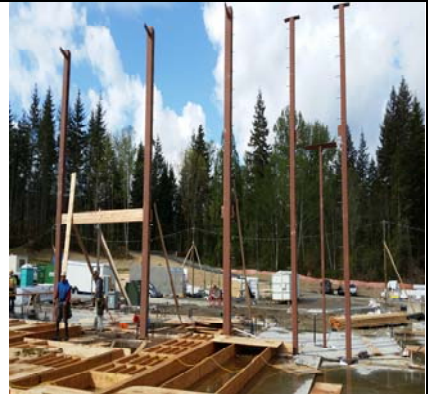
NW Wing - Structural Steel Erection