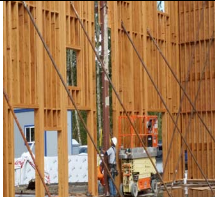
NW Wing - Steel Column Install West Wall