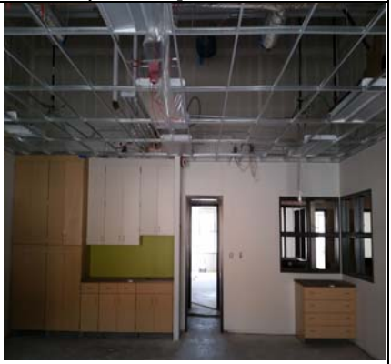
South Wing Pending Flooring