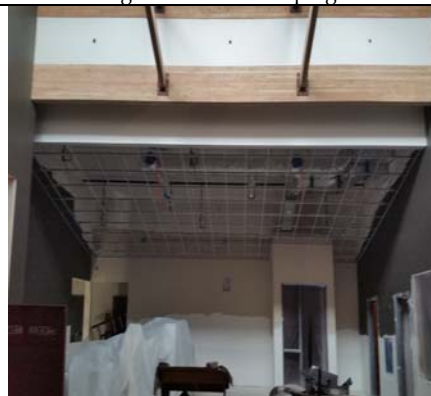
Library Ceiling Grid Installation