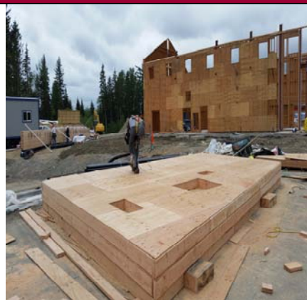
NW Wing - Prefab West Side Short Walls