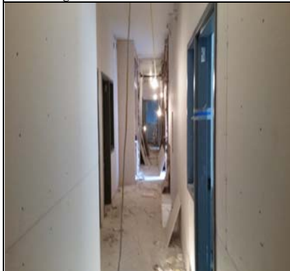
Admin Wing - Interior Hallway