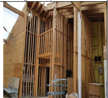
Main Entry/Admin Wing Connection