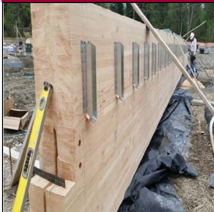
Third Largest Beam Prepared For Install

Pictures Taken: 4/27/2016 - 12:00 p.m. Progress Photographs