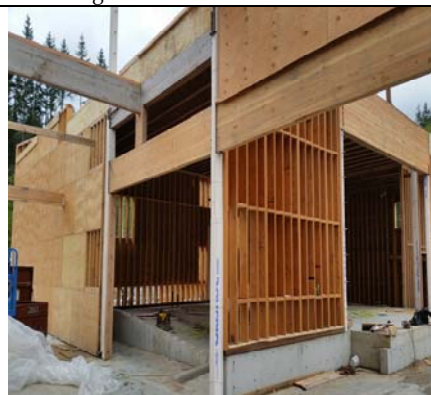
Main Entry/Multi-Purpose/Stage Connection