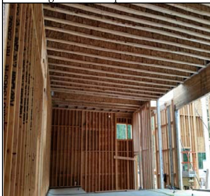
NW Wing - Mechanical Mezzanine Floor