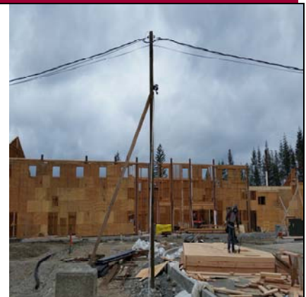
NW Wing - West Gym Wall