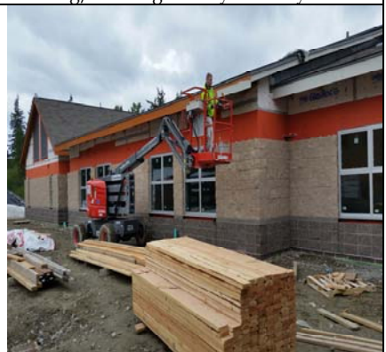
Painting Outside Eaves & Trim Boards