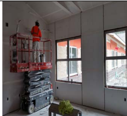
Admin Wing - Sheetrock & Taping