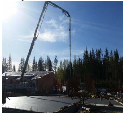
Gymnasium Concrete Pour In Progress