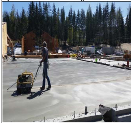
Concrete Cutting To Minimize Cracking