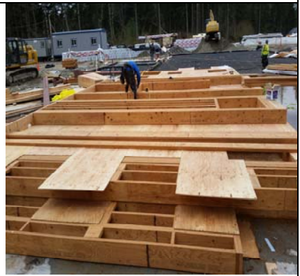
Pre-Fabricated Gym Walls Pending Install