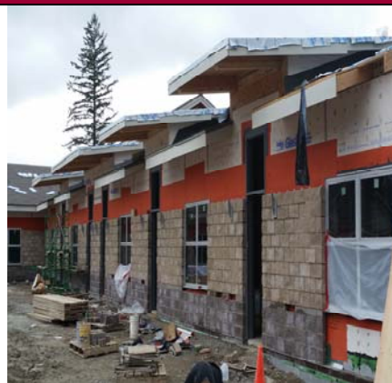
Kindergarten Shed Roof Construction