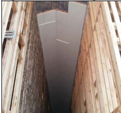
Two Layers Sheetrock At All Roof Trusses