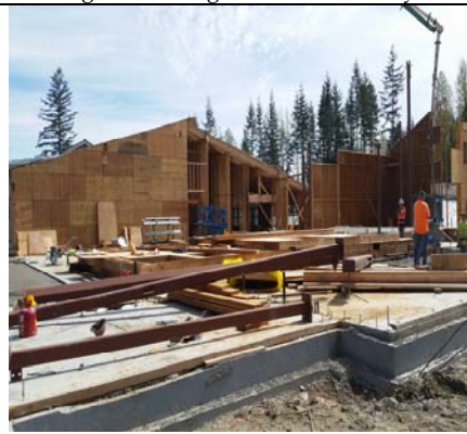
Remaining Steel Pending Installation