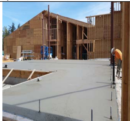
Looking Across Stage To Main Hallway