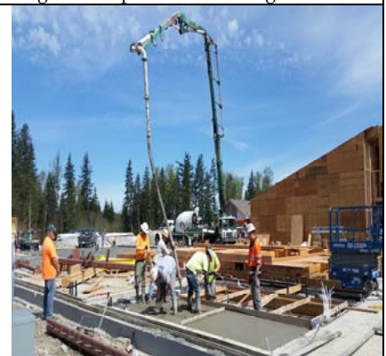
Last Of The Concrete Poured In Kitchen