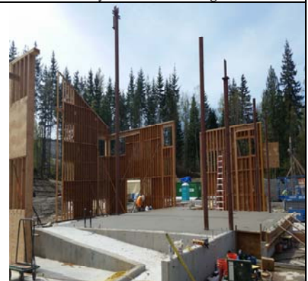
Stage Steel Up - Concrete Being Finished