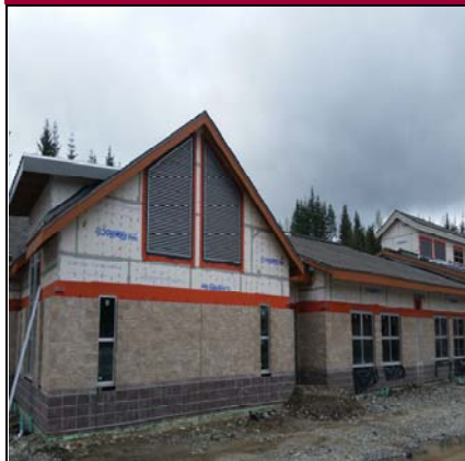
Large Exterior HVAC Vents Going In

Pictures Taken: 4/6/2016 - 12:00 p.m. Progress Photographs