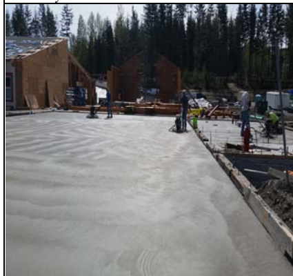
Gymnasium Concrete Being Finished