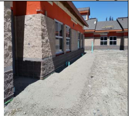
...And Compacted Gravel For More...