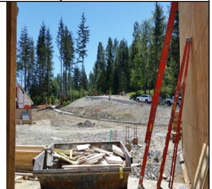
...To The Main Entry Connection Point