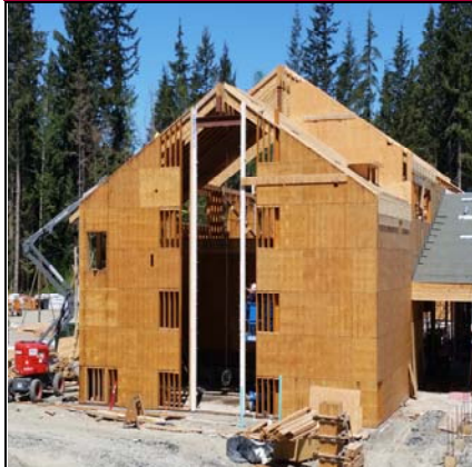
Music Room & Mechanical Mezzanine

Pictures Taken: 5/11/2016 - 11:30 a.m. Progress Photographs