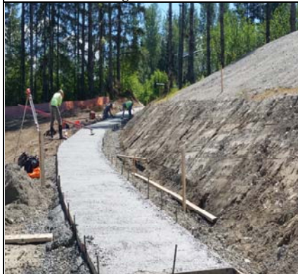
ADA Sidewalk From The Parkway Corner