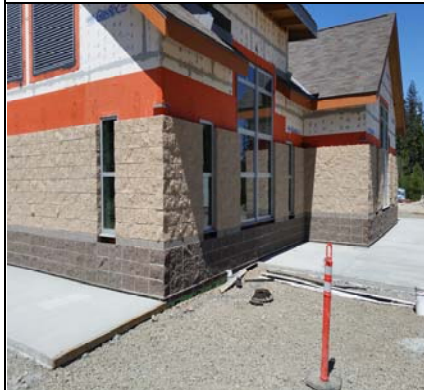
Sidewalks Coming To Meet At Corners