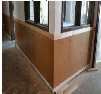
Wainscot Hallway Protection Has Begun