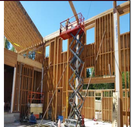
Kitchen Walls & Roof Trusses Beginning