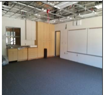
Classroom Carpet Installation Has Begun