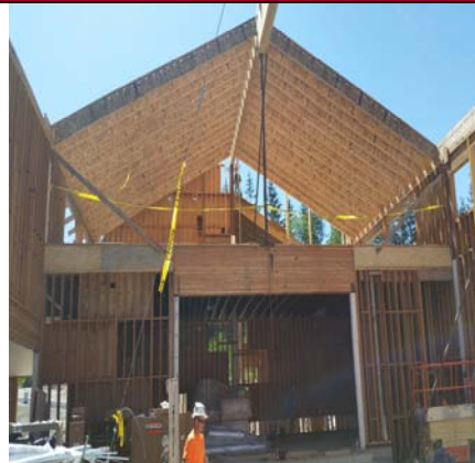
Stage & Mechanical Mezzanine