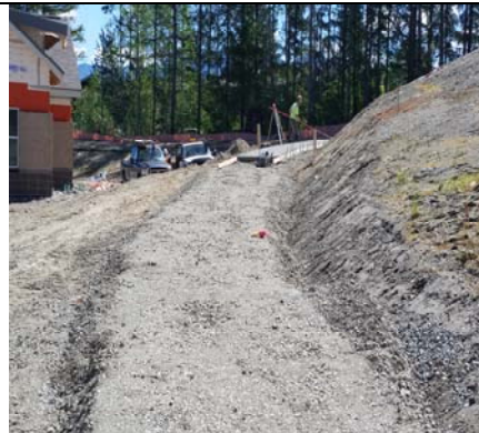
...And Getting Ready To Continue Down...