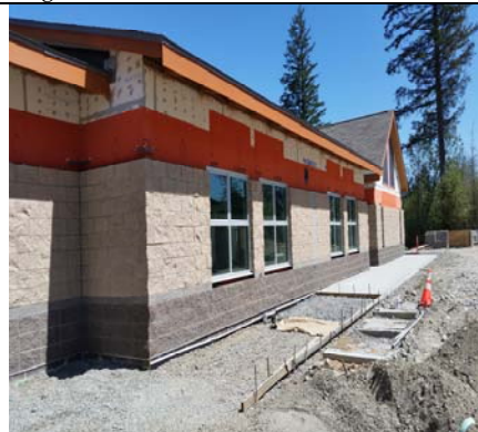
...And Continuing Around The Classrooms