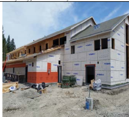
...Pending Weather Barrier & Masonry