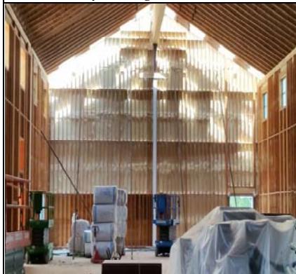
NW Wing - Spray Foam Complete