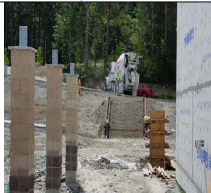
Entryway/Grand Entry Stair Construction