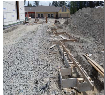
Entry Plaza Sitting Wall Being Formed