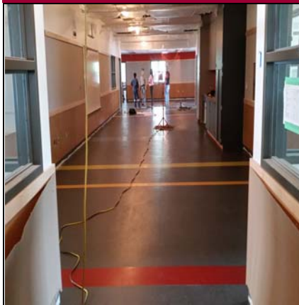
Hallway Flooring In North Wing

Pictures Taken: 6/8/2016 - 11:30 a.m. Progress Photographs