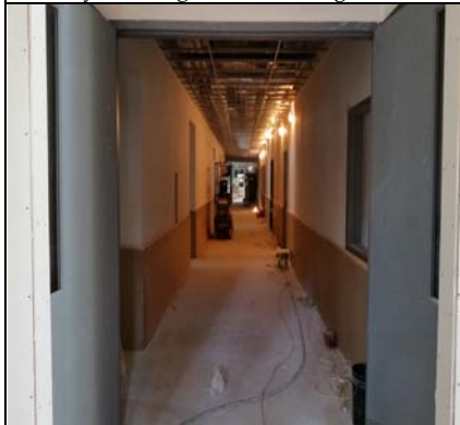
Main Hallway Ceiling Grid Installed