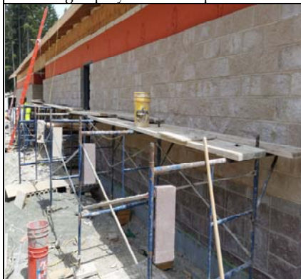
NW Wing - Block Masonry Continues