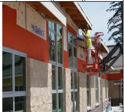
...And The Painters Chasing Everyone