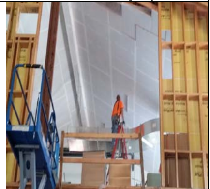
NW Wing Mechanical Mezzanine