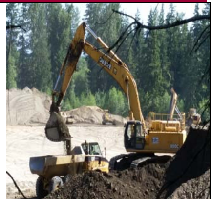
On Site Gravel Haul For Structural Fill