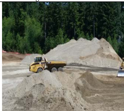
On Site Soil Stockpile For Future Use