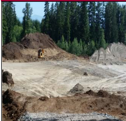
Site View - West Side Looking N.E.

Pictures Taken: 6/10/2015 @ 9:50 a.m. Progress Photographs