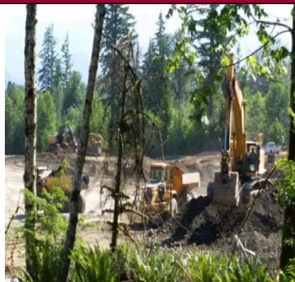
Gravel Brought On Site For Structural Fill