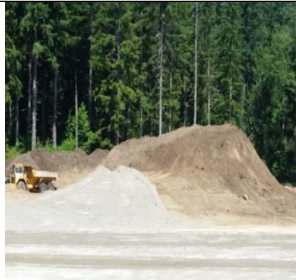
Topsoil Stockpile (Back) & Soil To Move