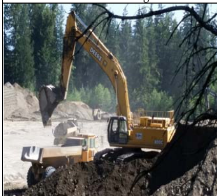
On Site Gravel Haul For Structural Fill 2