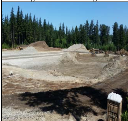
Site View - South Side Looking North