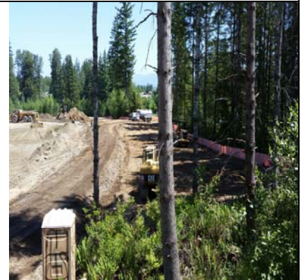
Site View - South Side Looking N.E.