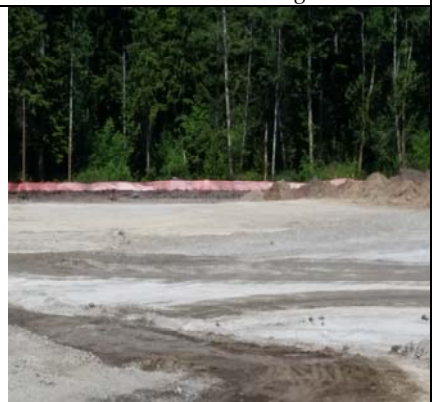
Site View - South Side Looking N.W. 2