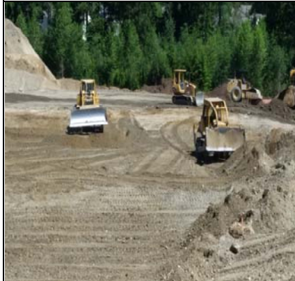
Continuing To Achieve Site Subgrade