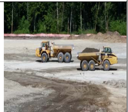
On Site Gravel Haul For Structural Fill 3