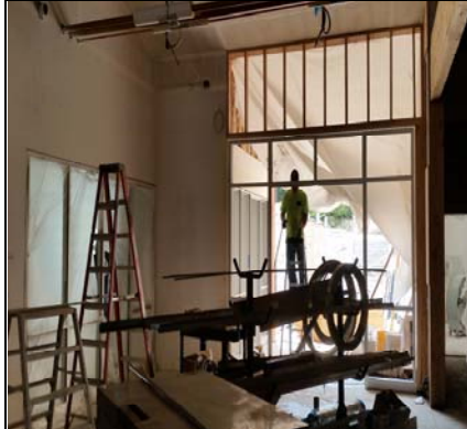
Main Entry Area