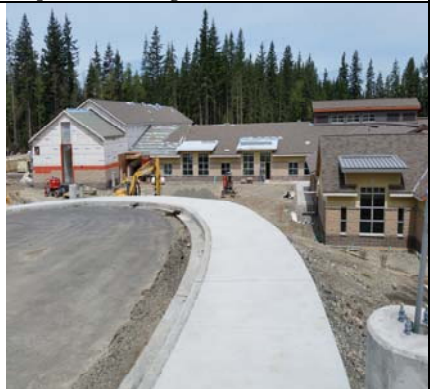
Front Area Pending Landscaping