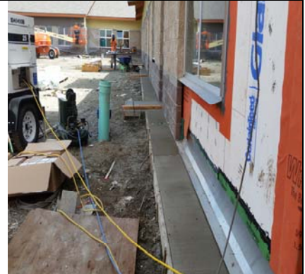
Asphalt/Building Concrete Connection