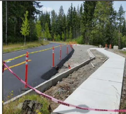
Entry Connection Ready For Asphalt