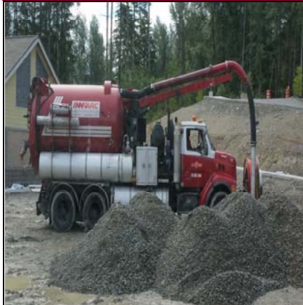
Cleaning Out The Storm Drainage System

Pictures Taken: 6/22/2016 - 11:30 a.m. Progress Photographs