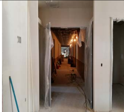
Main Hallway To Media Center