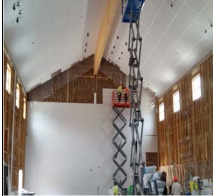
...More Gymnasium Sheetrock