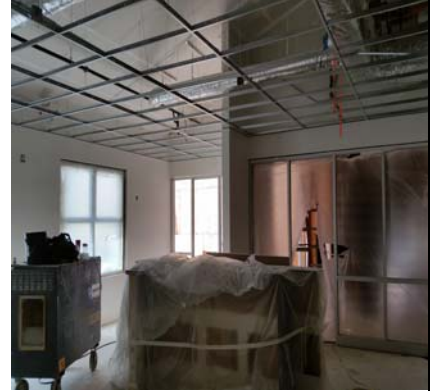
Administration Reception Area