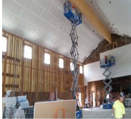
...And More Gymnasium Sheetrock