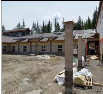
Rear Playground Area Pending Asphalt