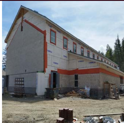
Gymnasium Pending Covered Play Area