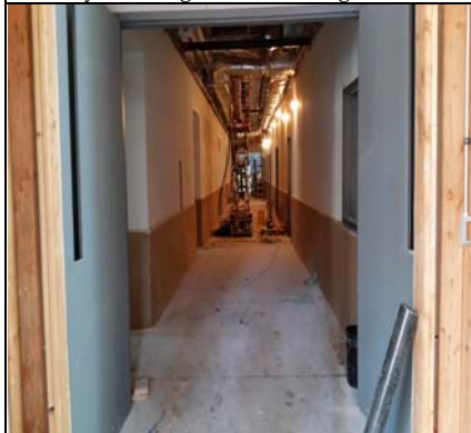
Main Hallway Coming Together