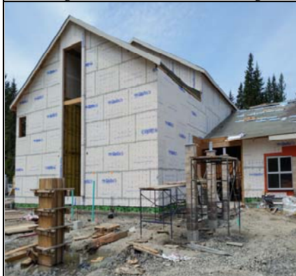
NW Wing Dry In - Pending Windows