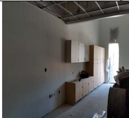
Kindergarten Casework Going In