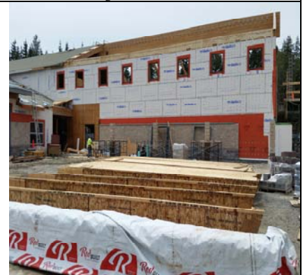
NW Wing Trusses Pending Installation