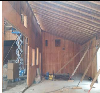
Kitchen/Serving Area Taking Shape