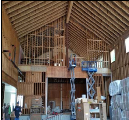
NW Wing Mechanical Mezzanine Progress