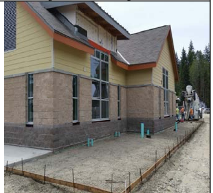
Sidewalks Moving Around The North Side