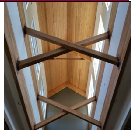
Clearstory Nearing Final Finishes