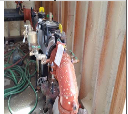
Main Plumbing & Fire Line Connections