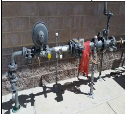
PSE Gas Meter And Assembly Ready