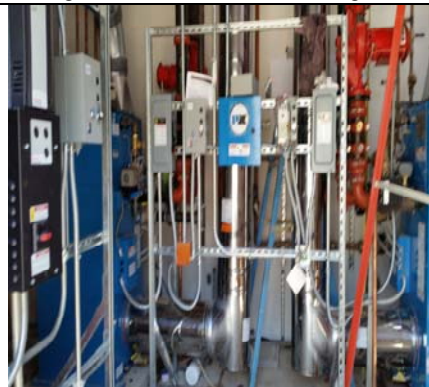
Boilers And Controls Ready For Start Up