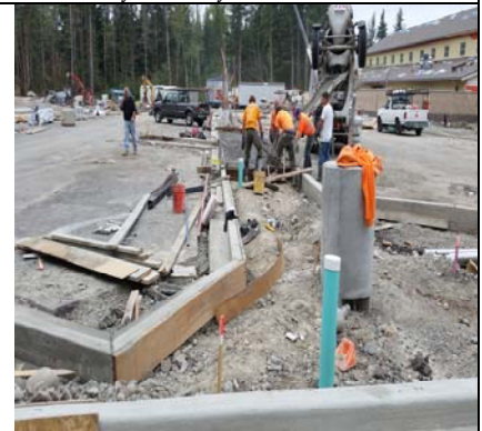
Handicap Access Island Being Poured