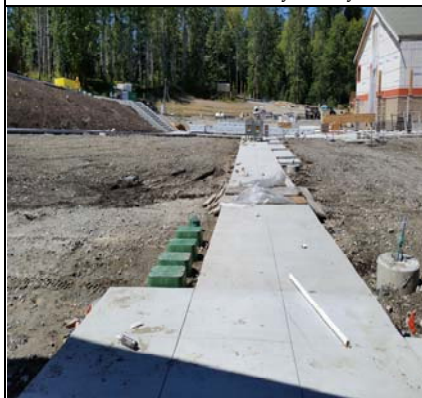
Irrigation Control And Landscape Base