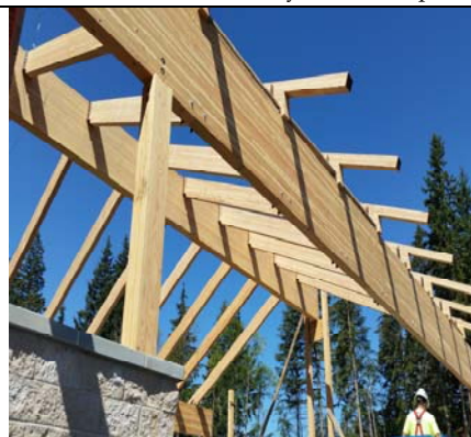
Covered Play Glulam Frame In Process