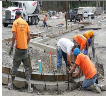
Parking Island Curb And Gutter Forming