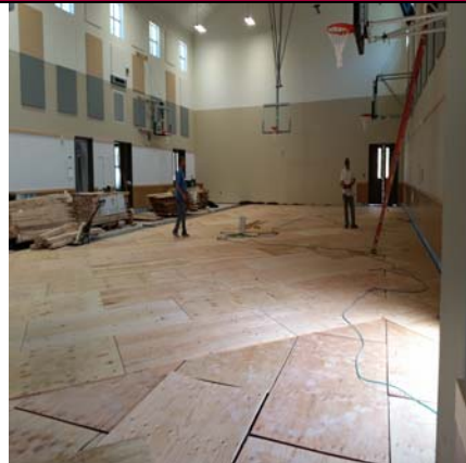
Gym Floor Plywood Sub-Flooring