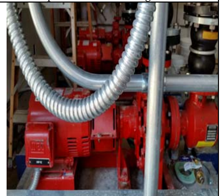
Hydronic Pumps Wired And Ready