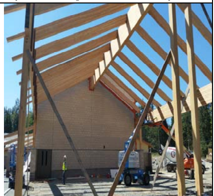
Covered Play Pending Roofing & Asphalt