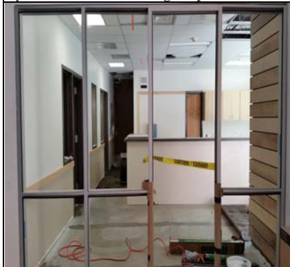
Administration Office Floor Preparation