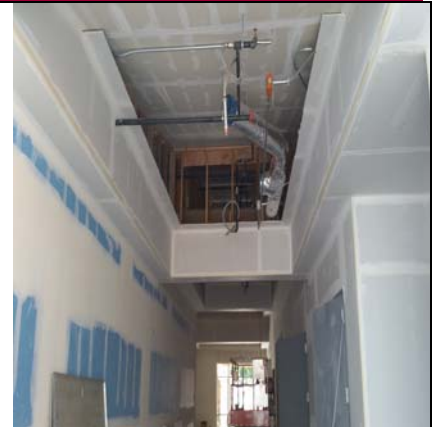
Main Entry Hallway In Process