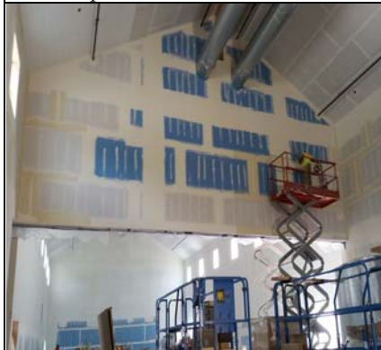
Multi-Purpose Walls Taking Shape