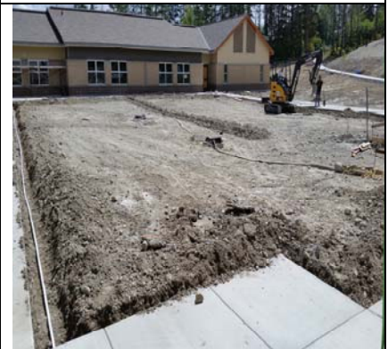
Irrigation Lines Being Installed