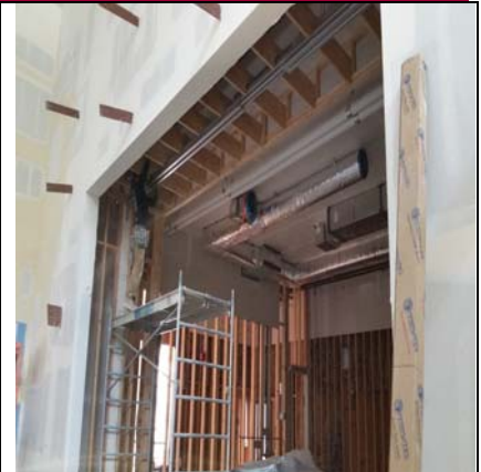
Operable Wall Slide Track Installation