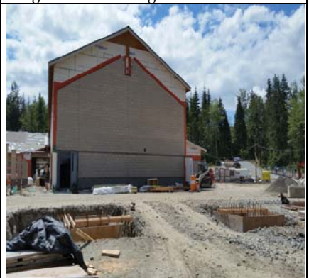
Covered Play Footings Pending Framing