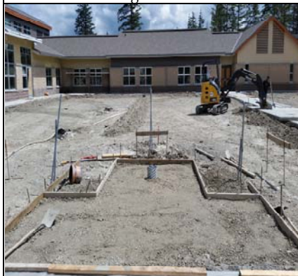
Flagpole Base Area Pending Concrete