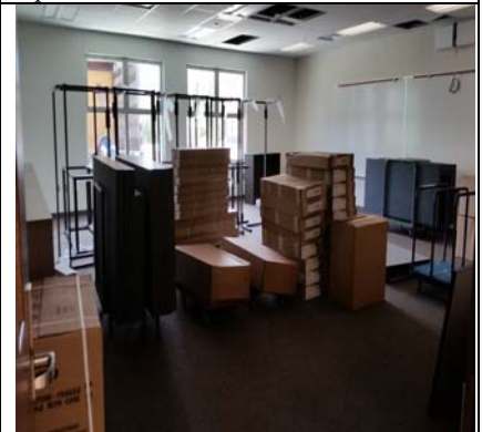
Desks & Tables To Be Assembled