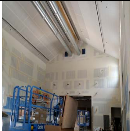
Stage Wall Taking Shape