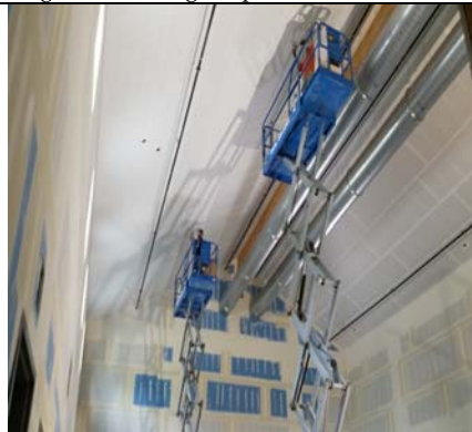
Acoustical Ceiling Tiles Being Installed