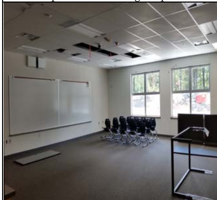
Classrooms Waiting For Furniture