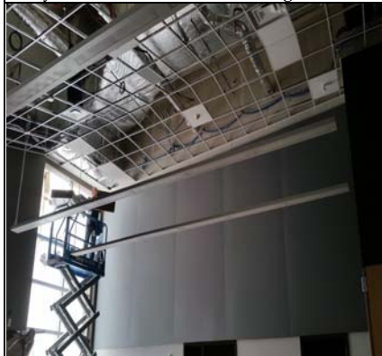
Music Room Ceiling And Window Install