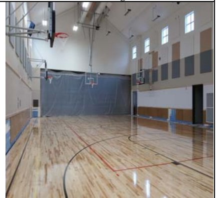
Gym Ready For Operable Wall Install