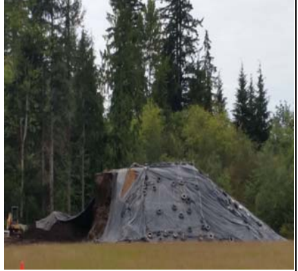
Phase 1 Stockpile Going Into Landscape