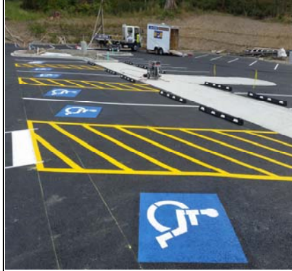
Disabled Area - Walkway - Wheel Stops