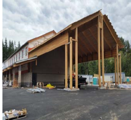
Covered Play - Walkway - Upper Siding