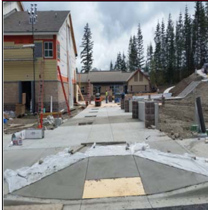
Entry Plaza From Arrival Parking Lot

Pictures Taken: 8/10/2016 - 11:30 a.m. Progress Photographs