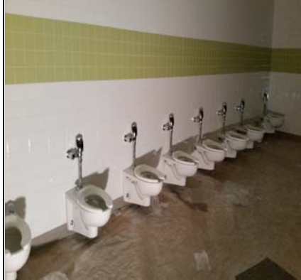
Gym Restrooms Pending Flooring & Stalls