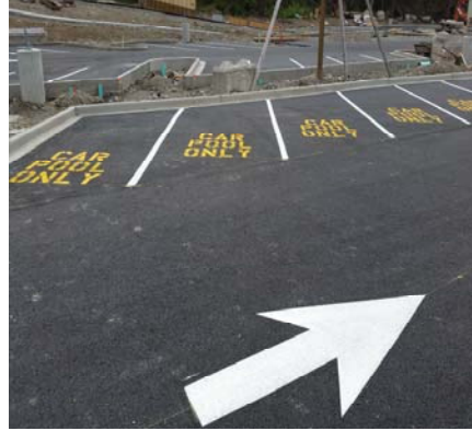
Car Pool Parking - Directional Signage