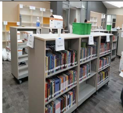
The Media Center Book Install In Process