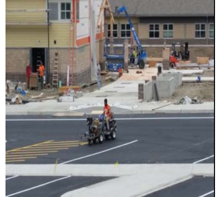
Parking Lot Striping - Entry Plaza