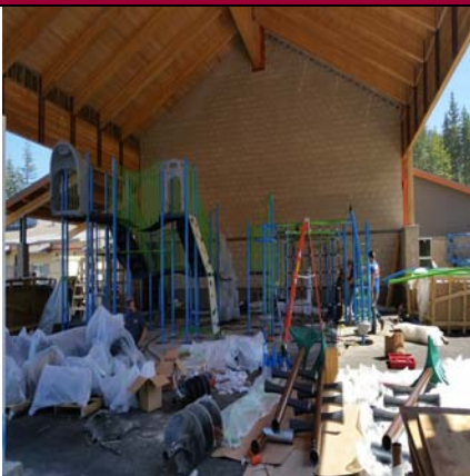
Climbing/Play Toy Under Covered Roof