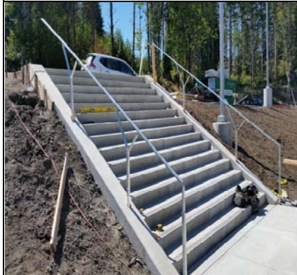
Safety Stair Railings In Process