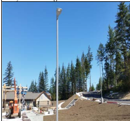
Light Poles Up - More Trees Pending