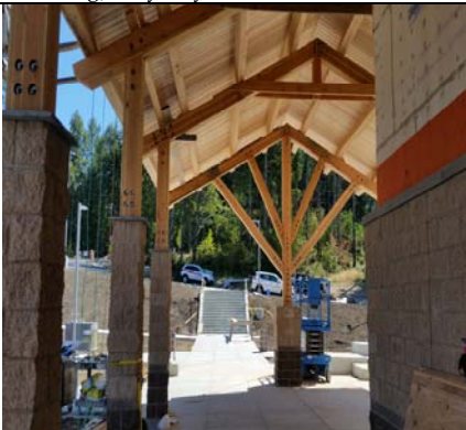
Main Entrance From Entry Vestibule