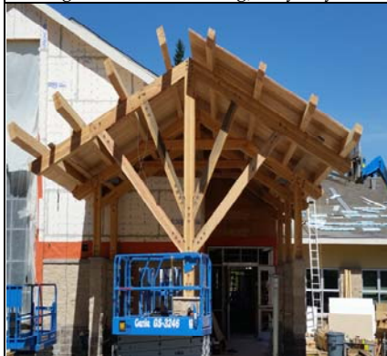
Main Entrance "Tree" - Post Structure