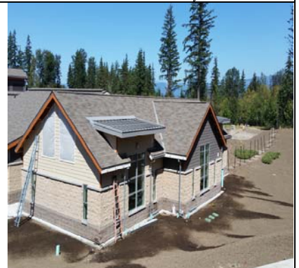
Topsoil - Irrigation - Shrubs - Fencing