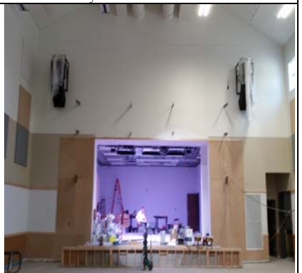
Stage Pending Final Wood Trim Framing