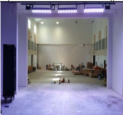
Multi-Purpose View Under Stage Lighting