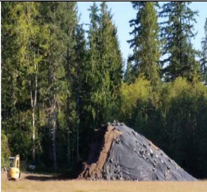
Topsoil Relocation At 50% And Climbing