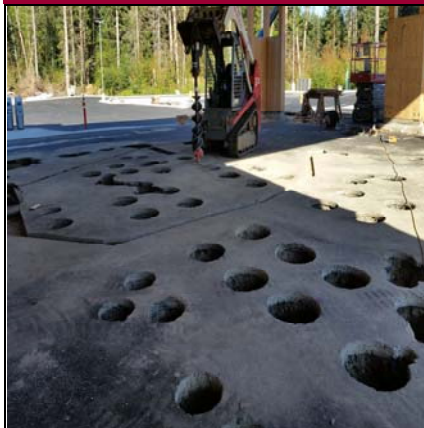
Footing Holes For Climbing/Play Toy

Pictures Taken: 8/17/2016 - 11:30 a.m. Progress Photographs