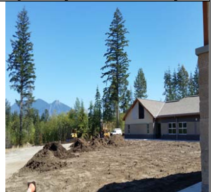
One Of Many On-Site Relocation Piles