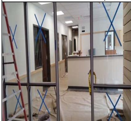
Building Access From Administration