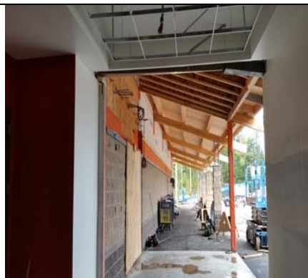
Rear Hallway Access Pending Vestibule