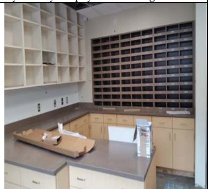
Teacher Mail Boxes Installed/Workroom