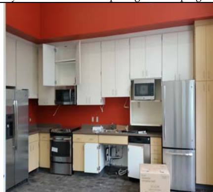
Staff Lunch Room Appliances Installed