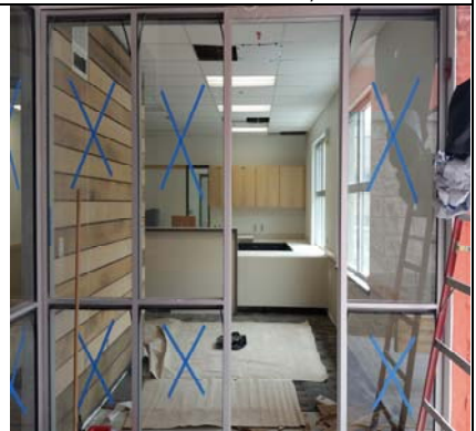
Entry Into The Administration Office