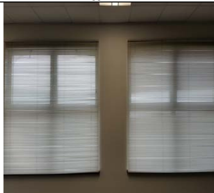
Interior Classroom Blinds - Exterior Wall