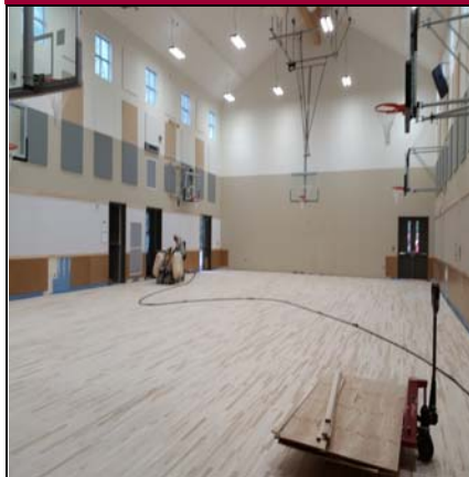
Sanding The Gym Floor - Tuesday 8/2