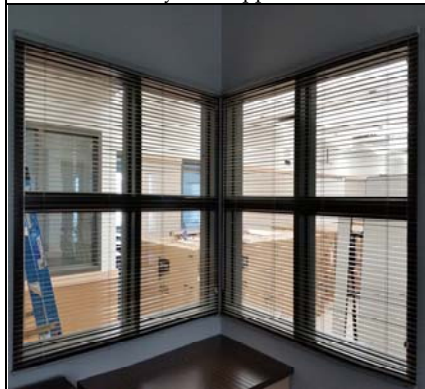
Interior Classroom Blinds - Hallway