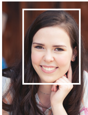
maximum recommended head size

PHOTOS MUST BE VERTICAL. NO HORIZONTAL PHOTOS!